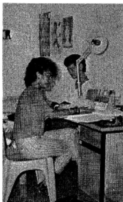
Students studying inside one of the well-equipped units. Each unit houses six students.