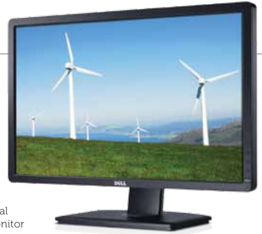
Dell Professional P2412H 24" Monitor