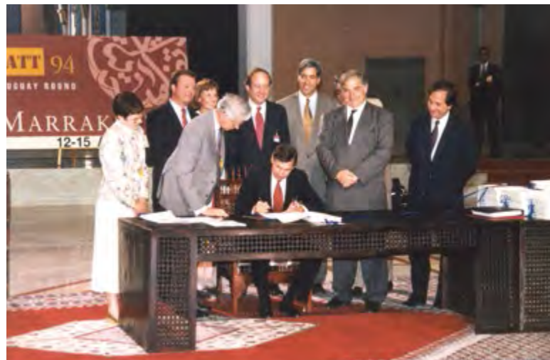
Signing in April 1994 of the Marrakesh Agreement, which formally established the WTO.

Since CITES predates the concepts of sustainable development and use as articulated in global environmental summits and international agreements, there is no express mention in the Convention of sustainable development. Nevertheless, the broad contributions of CITES to achieving sustainable development and use result directly from the text of the Convention and the way it is applied. Its requirements that trade not be detrimental to the survival of the species concerned, and that species be maintained throughout their range at a level consistent with their role in the ecosystem, contribute directly to achieving sustainable consumption and production – one of the key elements of sustainable development. The Convention's requirements that traded specimens be lawfully obtained and that Parties take appropriate measures to enforce the Convention also contribute to these objectives, as do efforts under the Convention to combat illegal trade in wildlife.