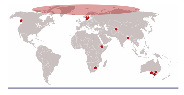
Fig. 1. Cases of resilience practice included in this study. The Arctic case covers a much larger area compared to the others, which are on a local-regional scale. Apart from the Arctic, included countries are: Australia, Bangladesh, Canada, Ethiopia, South Africa, Sweden, and Tajikistan.

While all cases deal with the governance of social-ecological systems for environmental and social sustainability, they represent different contexts and issues. All are place-based, in that they focus on a specific geographical area, but the scope ranges from vast regions such as the Arctic, to catchment regions (Goulburn-Broken, Murray, Kangaroo Island, Limpopo, and Helge å), local villages or towns and surrounding landscapes (local Ethiopia case, Tajikistan, Eskilstuna and ALH), and coastal areas (Pacific Herring, and Shyamnagar). In some cases, communities are more directly linked to and dependent on ecosystems and their resources (e.g., Tajikistan, Arctic, Pacific Herring, Shyamnagar), whereas in the Australian and Swedish cases, only a small part of the population is directly dependent on regional resources for their livelihoods. Several cases address very dynamic systems that have experienced major shifts (e.g., Shyamnagar, the Arctic, and Limpopo) while others exist in more stable contexts (e.g., the Swedish cases). The focal issues range from specific concerns, such as food security (Eskilstuna and Ethiopia) to a broader range of ecosystem services and issues tied to a particular landscape, region, or community (e.g., Goulburn-Broken, Limpopo, Shyamnagar, and Helge å).